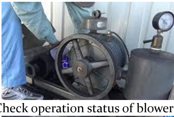
Check operation status of blower