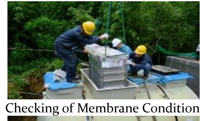
Checking of Membrane Condition