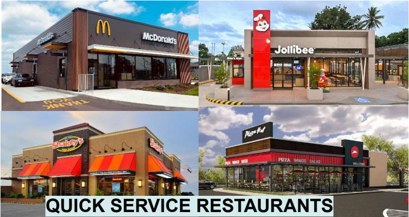
QUICK SERVICE RESTAURANTS