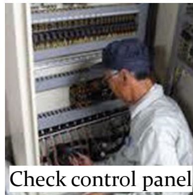
Check control panel