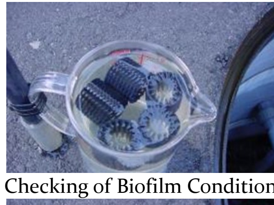
Checking of Biofilm Condition