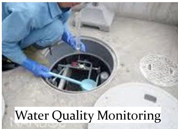
Water Quality Monitoring

With our local presence here in the Philippines, we ensure reliable after-sales service and support.